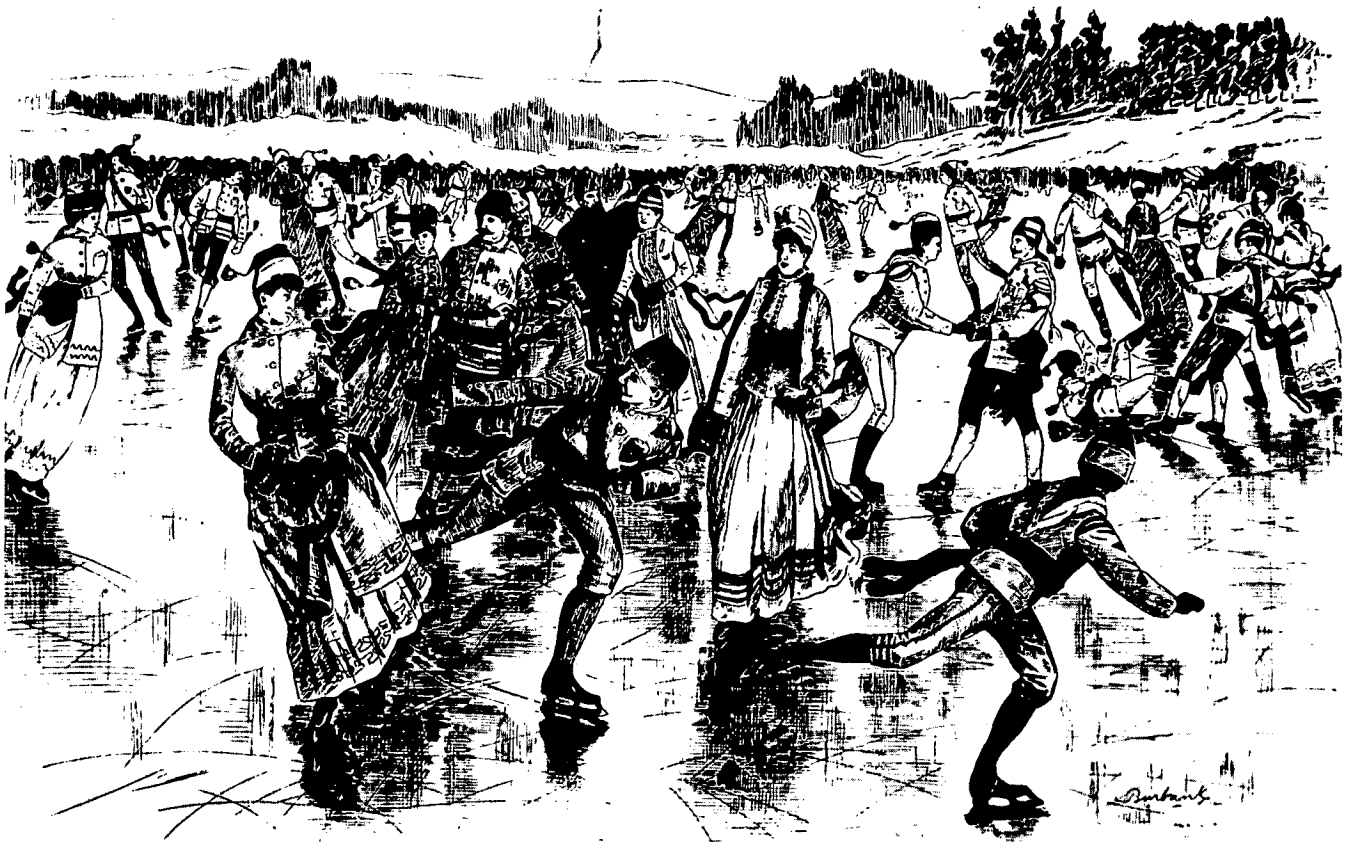
SKATING IN ST. PAUL.

E.3.c. The board may shall notify the vendor and the person receiving the cattle of the provisions of this section in person or by letter.