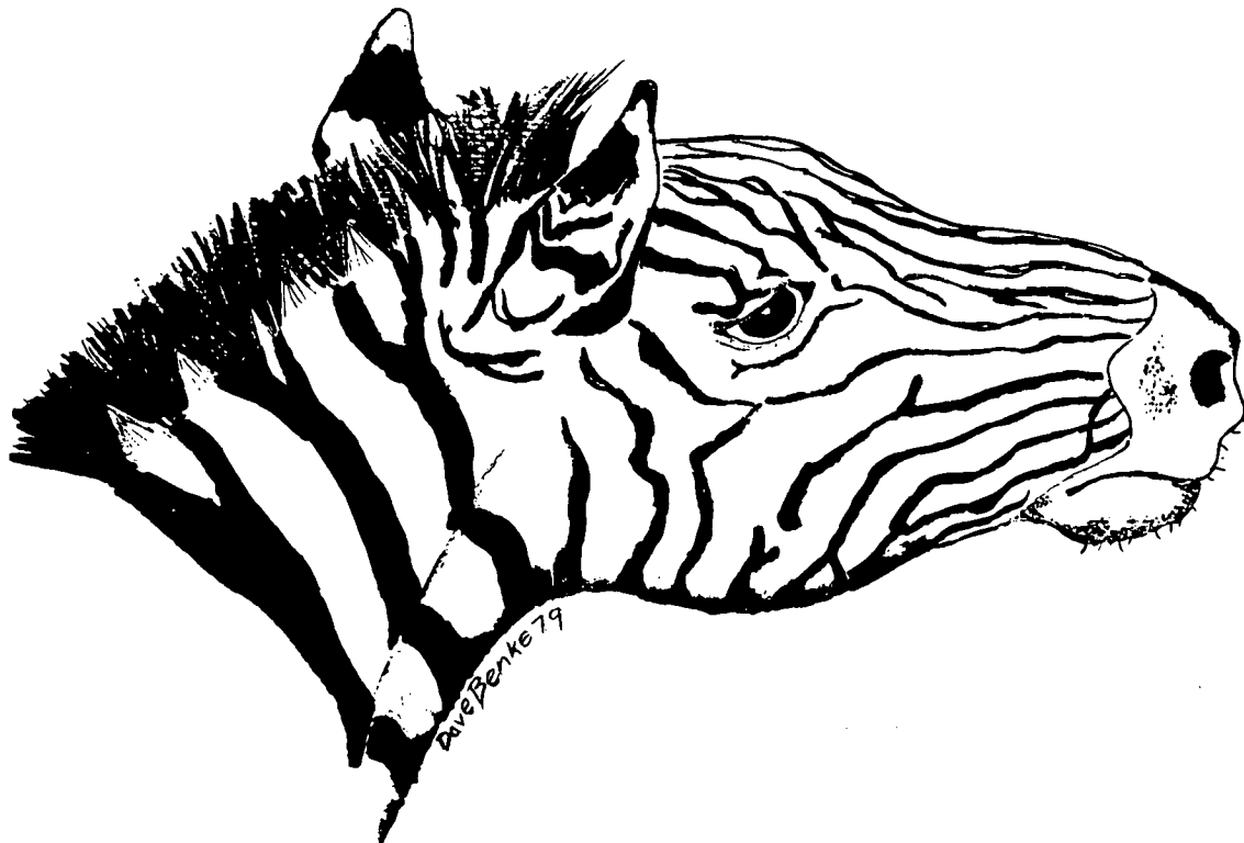
ZEBRA SIDE VIEW—Water color by David Benke, 12th Grade, Mayo High School, Rochester, MN

14 MCAR §§ 1.4025-1.4030 (proposed) ..... 1677 14 MCAR § 1.5050 (adopted) ..... 1643