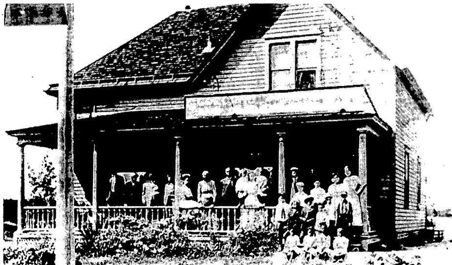
THE CRISPUS ATTUCKS HOME was the only institution for Afro-American orphans and old people in Minnesota during the early decades of the 1900s. This picture of the home, which was located in St. Paul, was taken in 1910.