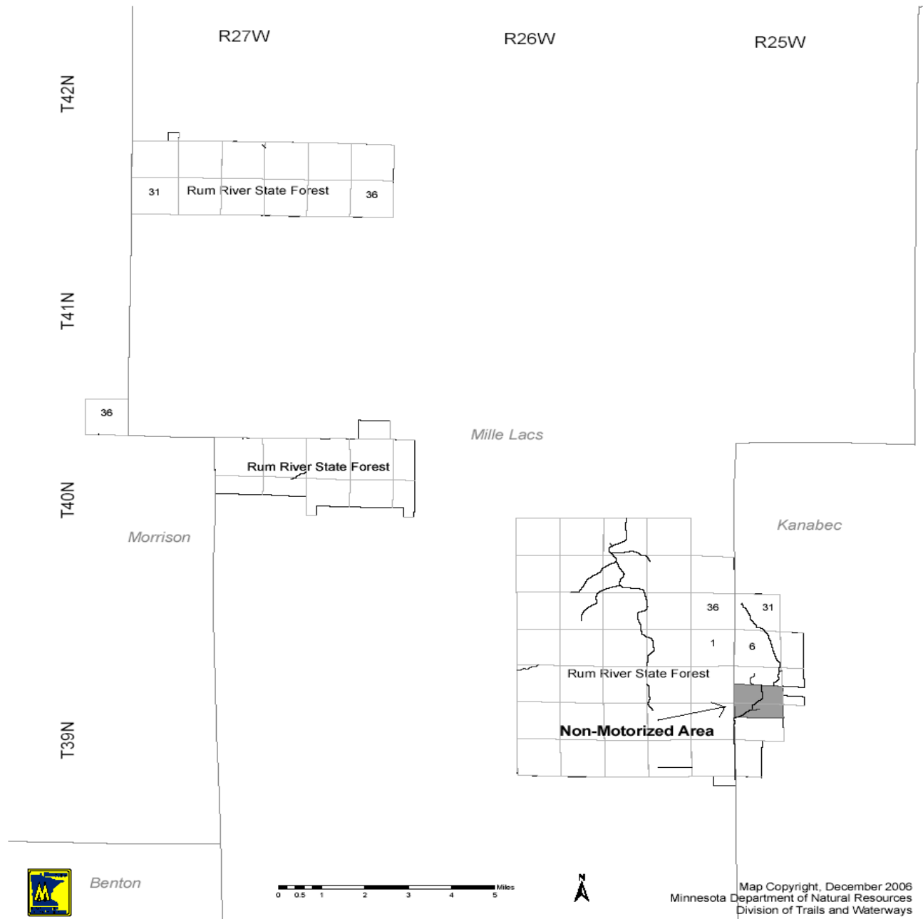
Exhibit A: Rum River State Forest Non-Motorized Area Designation December 2006