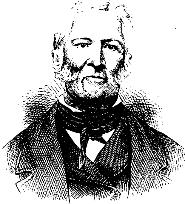
Jean Baptiste Faribault (1775-1860) traded furs in Minnesota for more than 30 years. A French-Canadian, he opened a trading company on Pike's Island and later moved to Mendota. During the War of 1812 he was offered a commission in the army to influence the Indians to fight the British. He refused and was arrested, but so impressed the officers with his determination and dignity that he was released without charges.

Pursuant to Minn. Stat. § 15.0412, subd. 4, agencies must hold public hearings on proposed new rules and/or proposed amendment of existing rules. Notice of intent to hold a hearing must be published in the State Register at least 30 days prior to the date set for the hearing, along with the full text of the proposed new or amended rule. The agency shall make at least one free copy of a proposed rule available to any person requesting it.