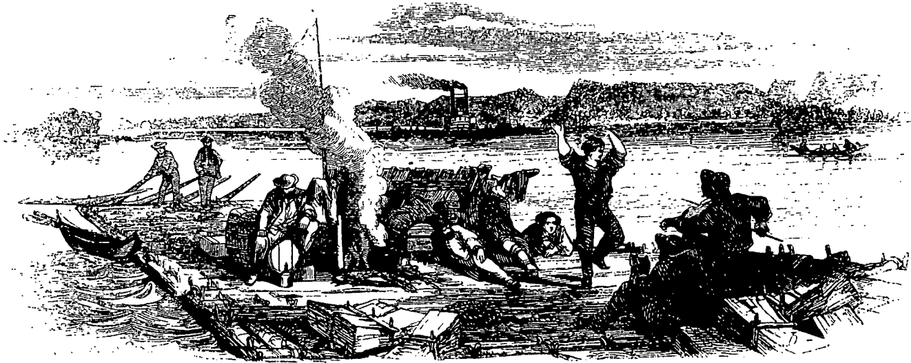
Rafting logs was a specialized business in early Minnesota. In the 1850s steamboats began towing the rafts, and the crews lived in tents or crude cabins on top of the logs. The pilot provided them with deck passage for the trip back up the river. With plenty of money and no work to do, the crews presented problems on northbound steamboats, according to one pilot's log. But at least "most of the drunken fighting was confined to the lower decks where it did not bother the cabin passengers."

The adoption of a rule becomes effective after the requirements of Minn. Stat. § 15.0412, subd. 4, have been met and five working days after the rule is published in the State Register , unless a later date is required by statutes or specified in the rule.