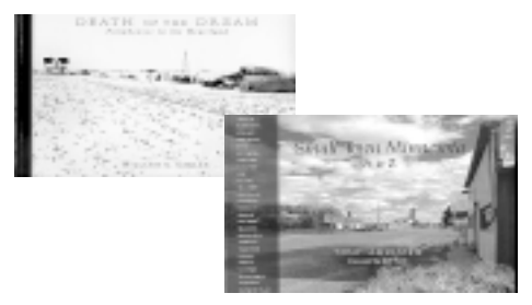
Visit our web site: www.minnesotasbookstore.com