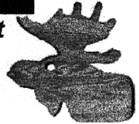
Cutting Board: MOOSE Stock No. 15-49 $48.95 $14.95