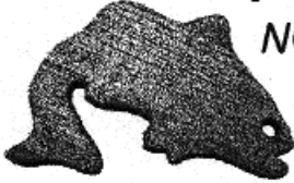
Cutting Board: FISH Stock No. 15-45 $48.95 $14.95

NOTE: Please place your order by phone or fax to confirm availability.