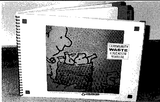
Community Waste Education Manual available at Minnesota's Bookstore

Publication editors: As a public service, please reprint this ad in your publication as is, reduced, enlarged, or redesigned to suit your format. Thank you.