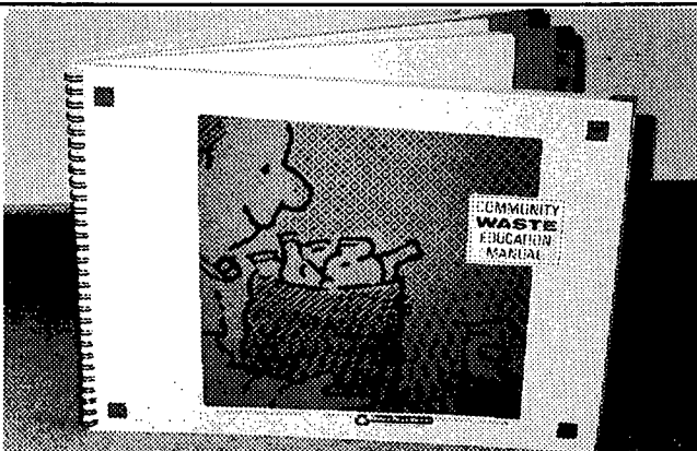
Community Waste Education Manual available at Minnesota's Bookstore

Publication editors: As a public service please reprint this ad in your publications. Thank you.