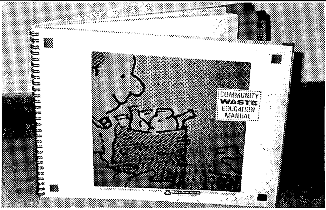
Community Waste Education Manual available at Minnesota's Bookstore

Publication editors: As a public service please reprint this ad in your publications. Thank you.