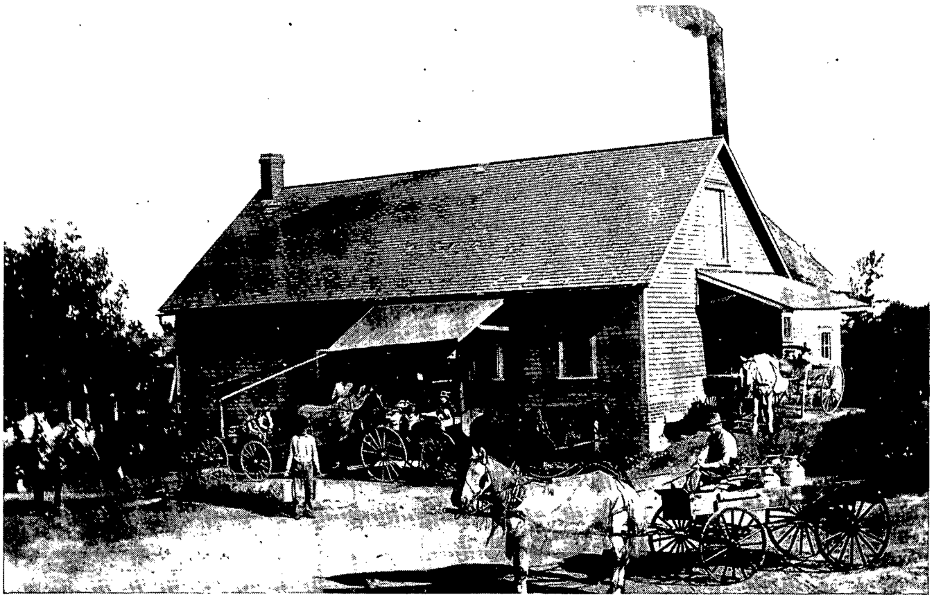
THE CREAMERY as it appeared in 1880 in Claremont, Minnesota.