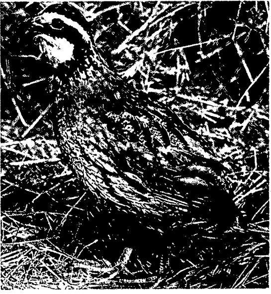
With the disappearance of much of the natural prairie land, the bobwhite is not as common in Minnesota as it once was. It is a good friend of the farmer, feeding on cutworms and grasshoppers. The bobwhite resembles a chicken, and its reddish-brown feathers marked with black, white and buff provide it with camouflage. It is about 10 inches long. The bobwhite's call sounds like its name.