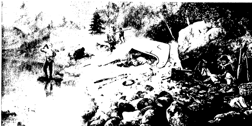
The mainstay of the voyageurs' diet was a soup made of dried peas or lyed corn, supplemented by berries, birds' eggs, fish, game, wild rice, and dried pemmican (pounded buffalo meat and berries preserved in grease). On this diet they paddled twelve hours a day and walked portages carrying heavy packs. A canoe party camping in the rain is shown in this oil painting by Mrs. Hopkins.