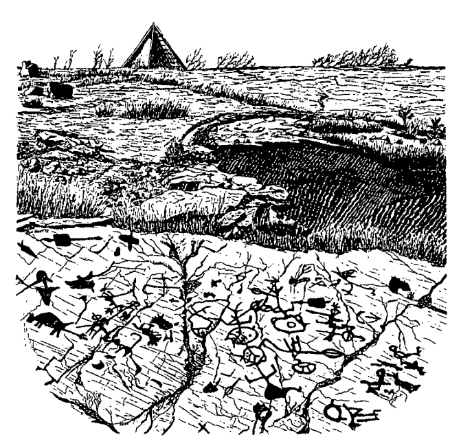
Discovered in 1891, the petroglyphs at Jeffers probably were made during the Late Archaic-Early Woodland period (3,000 B.C. to 500 A.D.) and the late Woodland period (900-1,700 A.D.) by prehistoric tribal groups. Located on Cottonwood County Road No. 2, the site is open daily during the summer. Drawing by Ron Hunt reprinted, with permission, from A Living Past: 15 Historic Places in Minnesota, copyright 1973, 1978 by the Minnesota Historical Society.

The Department of Education was recently reorganized to bring about a more efficient grouping and delivery of serv-