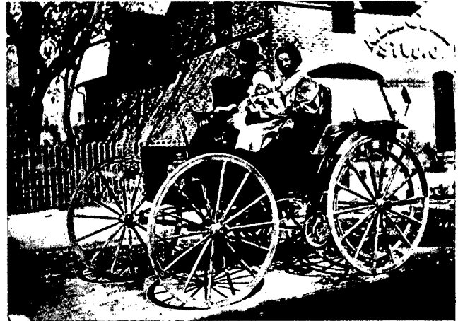
Early automobiles looked like the horse-drawn buggies that preceded them. They had big wheels to help them travel on slippery, muddy roads. The first cars appeared in Minnesota about 1900. This one was photographed in Redwood Falls about 1902. In that year a Minneapolis driver was arrested for exceeding the speed limit of ten miles an hour.

The court of appeals' factual determination of the reason-