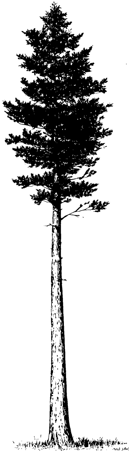
The Red or Norway Pine ( P. resinosa ), named for a small village in Maine, grows to a mature height of 80 feet and is abundant in the forests of Minnesota. Prized for its beauty and ornamental uses, it has light, open branching and a straight trunk covered with reddish brown bark.

Existing MOSHC 73 covers Paint Spraying-Building Interior on construction sites. Part (a) has to do with non-flammable paints and Part (b) has to do with flammable paints. In order to clarify this standard, it is necessary to add