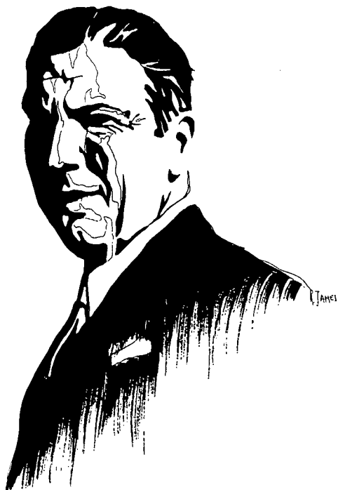
Floyd B. Olson (1891-1936) was Minnesota's first Farmer-Labor Party governor. Born in Minneapolis of Norwegian-Swedish parents, he spent many years as an itinerant worker before entering law school and later being elected Hennepin County Attorney. He felt close to the working class, and was known as a formidable trial lawyer and skillful public speaker. Olson was elected governor in 1930, holding the office through the intraparty and economic struggles of the early Depression years. A supporter of President Roosevelt's New Deal, Olson was expected to run for the Senate in 1936, but died the summer before the election.

Pursuant to Minn. Stat. § 15.0412, subd. 5, when a statute, federal law or court order to adopt, suspend or repeal a rule does not allow time for the usual rulemaking process, temporary rules may be proposed. Proposed temporary rules are published in the State Register , and for at least 20 days thereafter, interested persons may submit data and views in writing to the proposing agency.