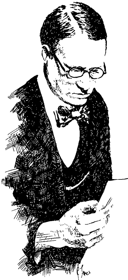
Sinclair Lewis (1885-1951) was a native of Sauk Centre, Minnesota. In 1930 he became the first American to win the Nobel Prize for literature.

Pursuant to Minn. Stat. § 15.0412, subd. 5, when a statute, federal law or court order to adopt, suspend or repeal a rule does not allow time for the usual rulemaking process, temporary rules may be proposed. Proposed temporary rules are published in the State Register , and for at least 20 days thereafter, interested persons may submit data and views in writing to the proposing agency.