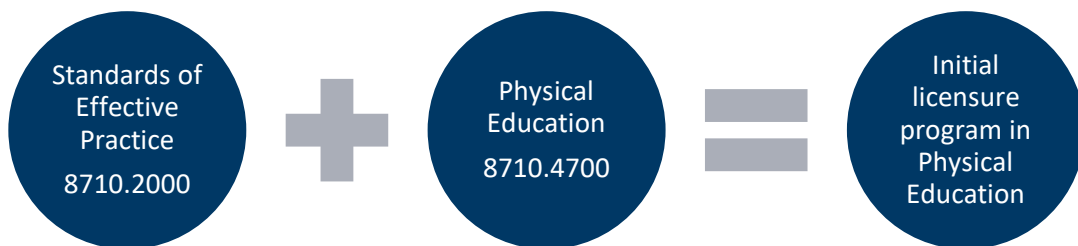
Figure 4: Licensure Standards included in an Initial Licensure Program in PE

Special education programs must include core skills standards that are applicable to each special education field respectively. Special education programs must include a core application (outlined in 8710.5000), as well as a disability specific application.