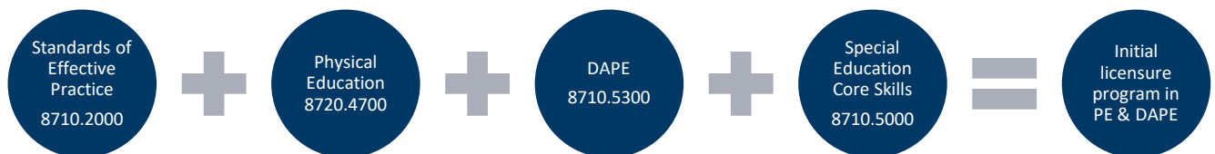
Figure 5: Licensure Standards included in a Dual Licensure Program in PE and DAPE

Special education programs must include core skills standards that are applicable to each special education field respectively. Special education programs must include a core application (outlined in 8710.5000), as well as a disability specific application.