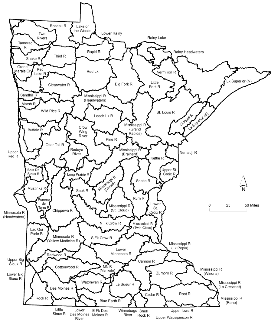
Major Watersheds in Minnesota

Statutory Authority: MS s 115.03; 115.44